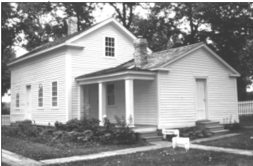
The John H. Stevens House (1849) was built on a simple broadside plan; it is now located in Minnehaha Park in Minneapolis. Note the eave-returns on the gables, the simple pilasters at the corners, and the six-over-six windows, which are characteristic of this style.

Before we consider the early styles, it is important to realize that there are categories of buildings for which no academic designation of a style can be assigned. These buildings, often referred to as "vernacular," include subsistence dwellings as well as in industrial structures. Most of these buildings were modest and constructed of readily available local materials. Log buildings were common in forested areas. Stone buildings could be found along rivers with limestone and sandstone ledges. Sod houses were