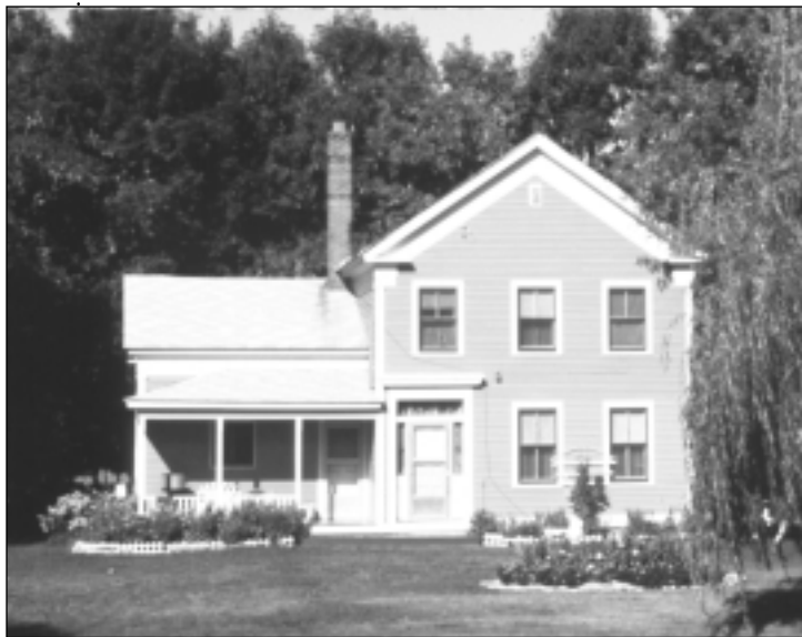
The Harrington House, an example of a "L" plan Greek Revival Style house. Note the 1 1/2 story kitchen at left. Built ca. 1860, it was moved to Irvine Park in St. Paul from Lake Elmo in Washington County.

e.g., two-by-fours, two-by-sixes, etc. The lumber was produced in commercial sawmills that first sprang up along the Saint Croix River and at the Falls of Saint Anthony. Early sawmills were water-powered, but the invention of the steam-powered mill made it possible to erect mills closer to the timber resources. Although the style was popular for all types of buildings—public, commercial and residential—the majority of surviving Greek Revival buildings are residences. They are found mainly in the Saint Croix, Mississippi and Minnesota river areas, and throughout southeastern Minnesota.